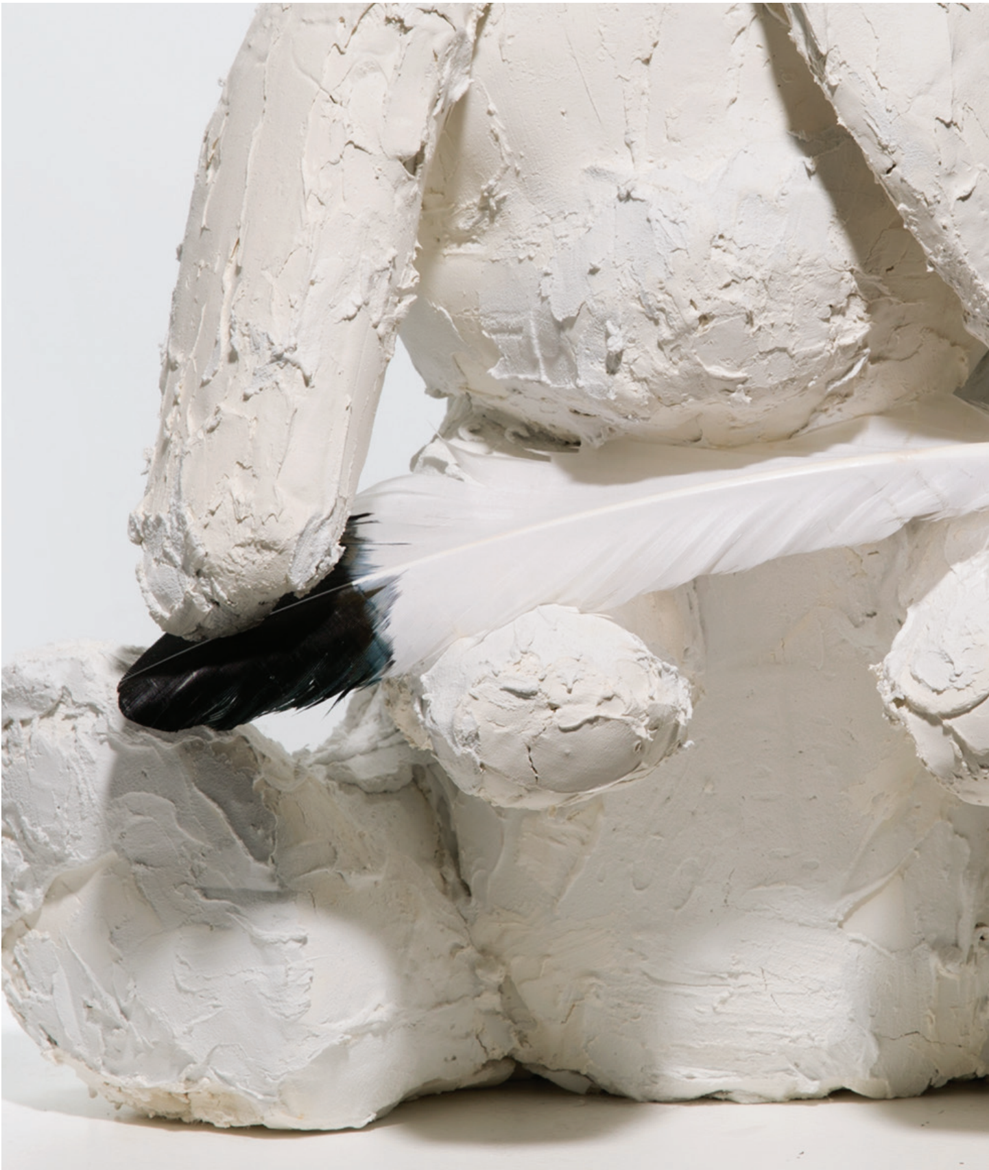
BUNNY WITH FEATHER 2016