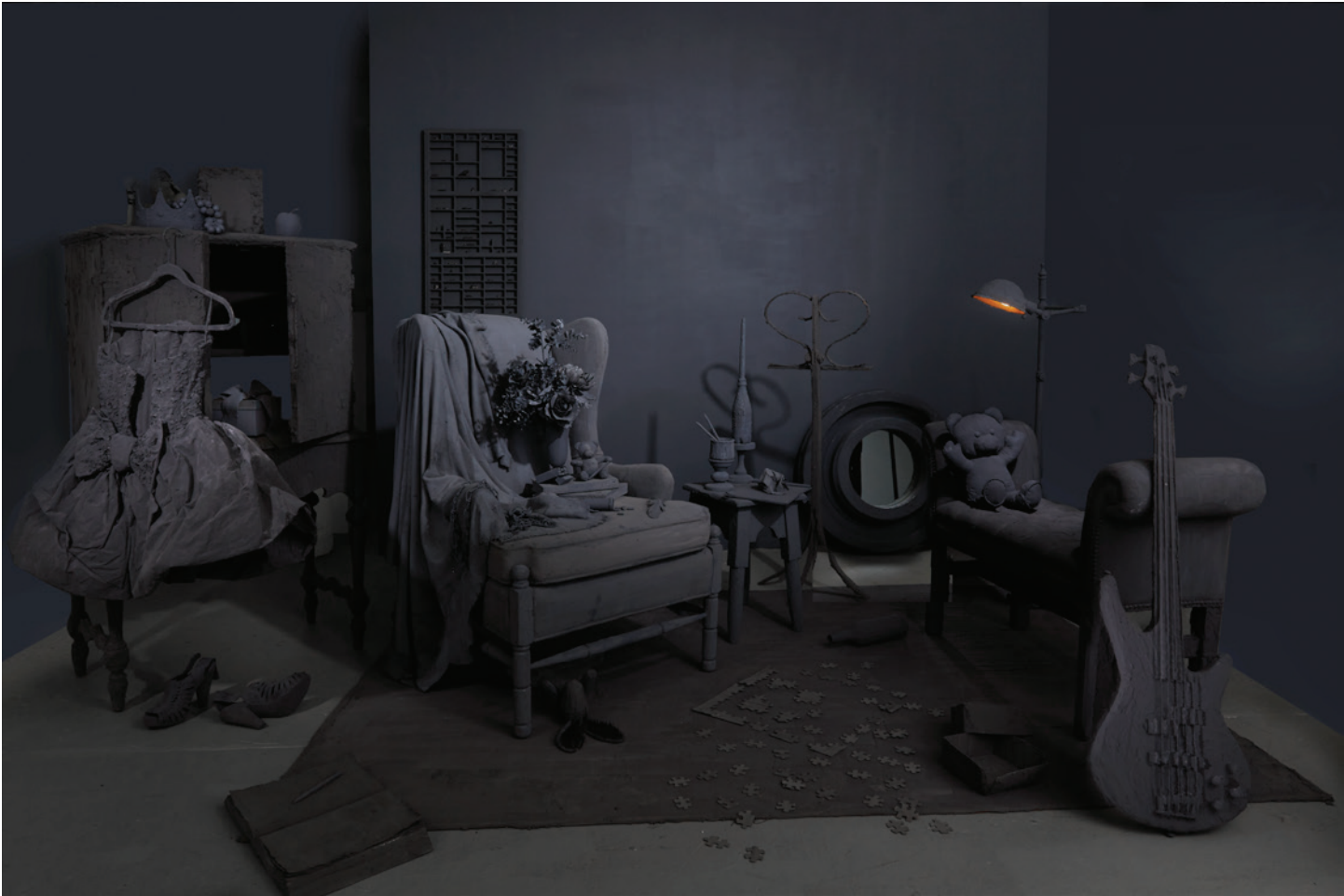
GRAY ROOM 2018