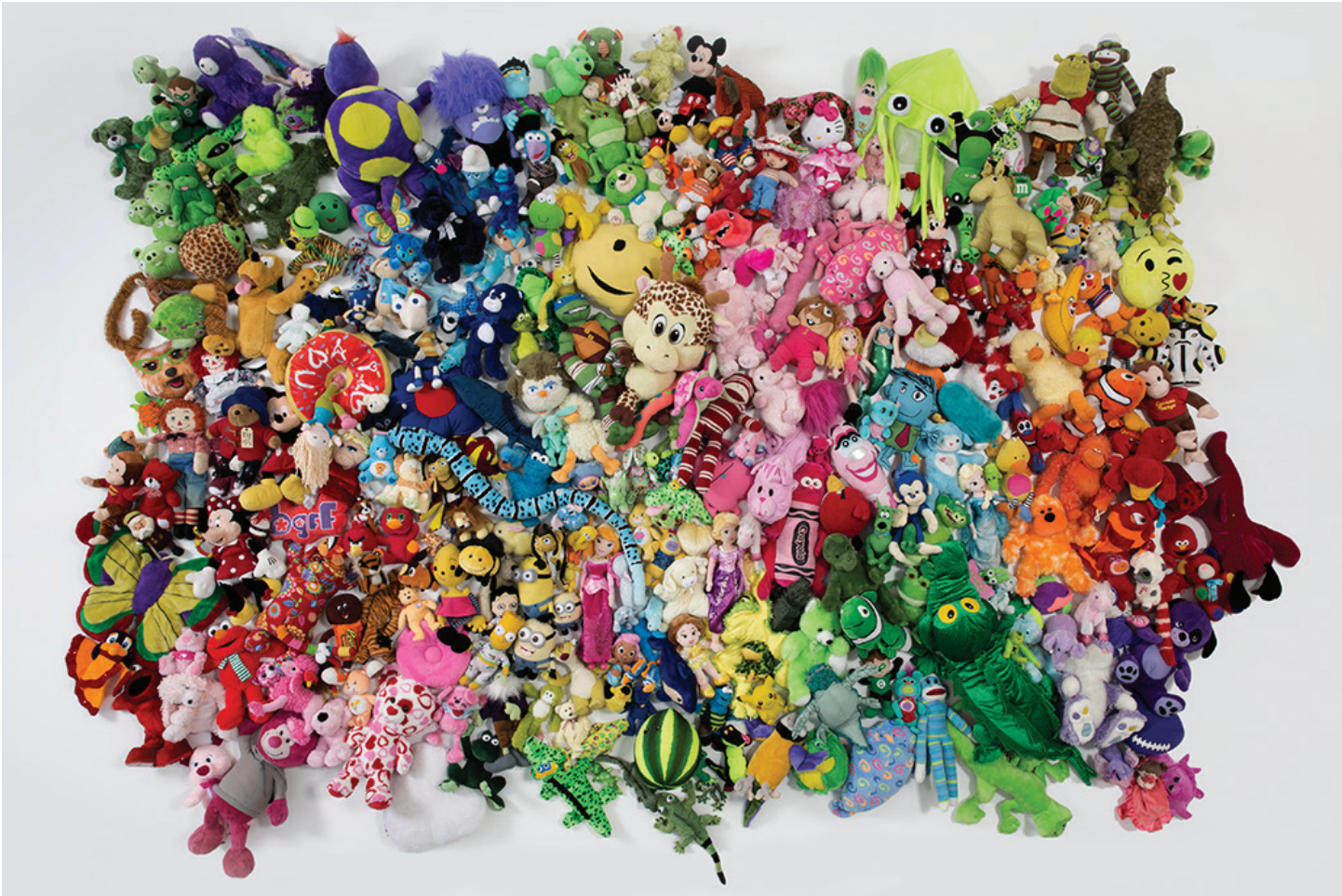
COLOR INSTALLATION SERIES VERSION 2, 2017